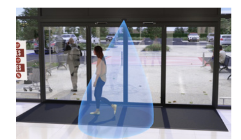
Cross traffic rejection